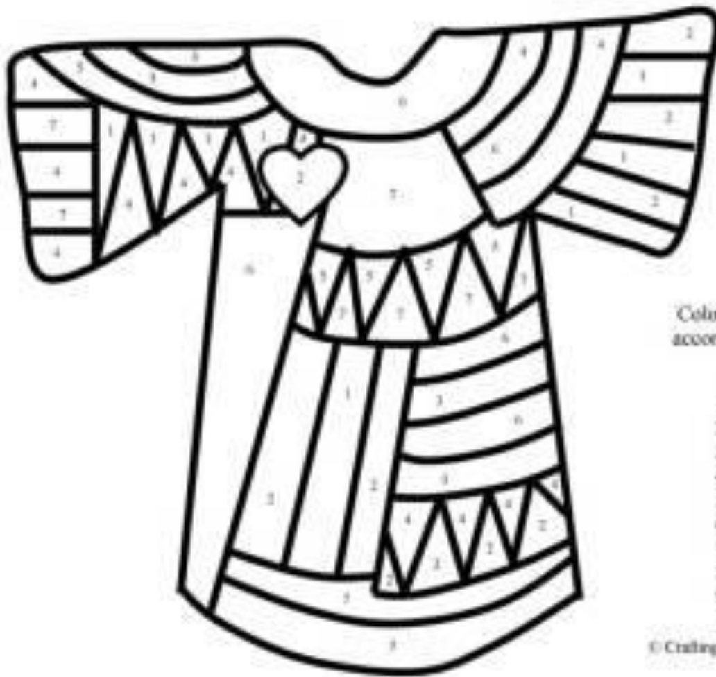
Joseph's Many Coloured Coat